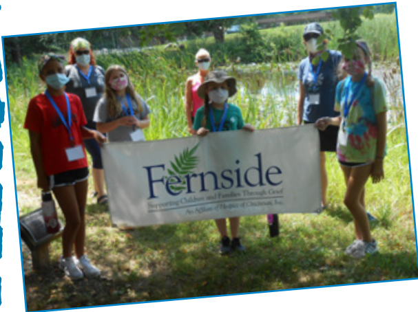
A scene from summer camp 2020

"My child had a great camp experience. She talked about it the whole way home. Being able to spend time with other children who have experienced a similar loss was helpful for her, because she knows that she isn't alone. It was also so helpful to have fun and do kid stuff with other kids. She enjoyed the time with other kids, especially since we've been so isolated recently due to COVID."