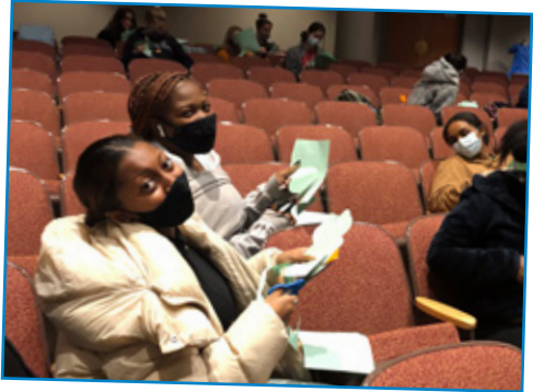
Mercy McAuley High School Service Learning Day

Our Community Outreach & Education Program showed us that we can adapt easily in a virtual world. Over the past year, we've been able to offer several virtual educational grief presentations to many audiences. We still love connecting in person and have adapted doing so safely.