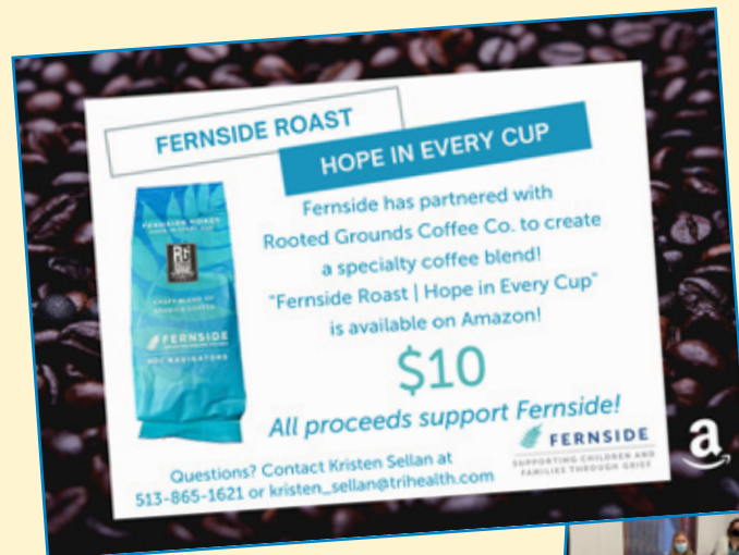
Fernside & The Bethesda Foundation Team Member Tasting